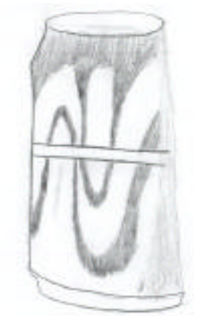
Figure 2: Interference fringes can be seen on an aluminum can when a double exposure hologram is made. The first exposure is taken with a rubber band around the center of the can, while the second exposure is taken once the rubber band is removed.

To ensure high quality of the image, the plate should be developed as soon after exposure as possible. The procedure for developing the plate should be included with the developing solutions. When the plate is dry, the threedimensional holographic image should be able to be seen with the diverging laser light. To project a two-dimensional image of the can onto a screen, remove the diverging lens and pass the laser beam through the plate. If there was enough strain on the can during the first exposure, an image should be seen similar to the one in figure 2.